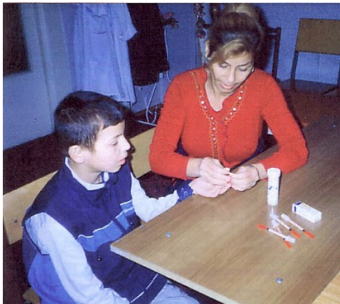
Child and mother in Ganja learning about self-monitoring with visual glucose strips