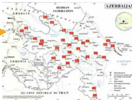
Map of Azerbaijan - flags show where LFAC-supported children live