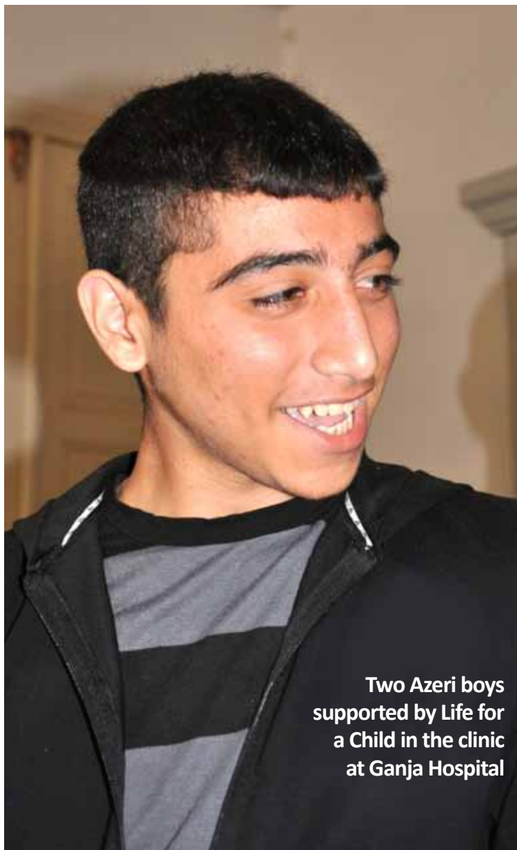
Two Azeri boys supported by Life for a Child in the clinic at Ganja Hospital

Update n° 21 | January 2012 | Central and South Asia